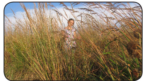
Lost in the tallgrass prairie.

When most people drive the interstate highways of Illinois and adjacent states, they are in a rush to get from here to there. They view mile after mile of corn fields, soy bean fields and the like and think, this is prairie. And they say to themselves: BOORING . But what they are looking at is not a prairie ecosystem. The natural prairie, before the introduction of John Deere's plow in the early 1800's, was a rich, diverse landscape.