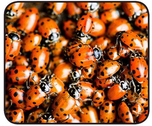
Ladybugs are not bugs, but beetles, and they’re precious to the natural gardener.

“Ladybug, Ladybug, fly away home. Your house is on fire and your children all gone.” This children’s nursery rhyme is thought to have originated as a gentle warning to our spotted insect friends. By whichever name you know them, ladybugs, ladybird beetles or lady beetles are wonderful pest controls for farmers and gardeners alike. These hungry insects will eat upwards of 5,000 aphids in its life-time. Also on the menu are other small insects such as whitefly, mealybugs, scales, mites, bollworms, broccoli worm, tomato hornworm and cabbage moth. They indulge in the eggs of some insects like moth eggs. Some lady beetles eat pollen and mildew.