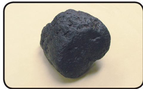
Magnetite. Looks like a piece of lava until you place a magnet next to it.