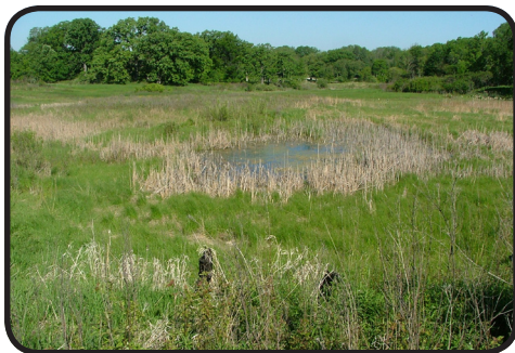
The Bluff Springs Fen in mid May. This landscape changes weekly.

If you want to get the most from our summer lecture series we're partnering with Friends of the Bluff Spring Fen and Friends of Trout Park for guided nature walks through these unique habitats. Experiencing these environments with an expert will make the lectures much more fulfilling.