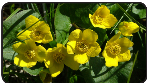
Marsh marigolds were abundant this spring

EPM is presenting three lectures this summer centering around some of the historic and natural history of our own neighborhood. (See our program schedule) Supplementing these programs we will be displaying pictures and text depicting two unique habitats here in Elgin.