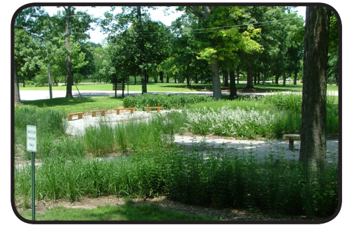
Native plants from 6" tall to 6' tall adorn our gardens.

June 12 the Elgin Area American Association of University Women will hold their Fox Valley Garden Walk featuring East side gardens. One stop will be the gardens on the west side of the Museum. There will also be artists at our location, along with food service. Hours are 9 am to 3 pm. Tickets are $12 in advance/$15 day of walk. Tickets are available at the Museum.